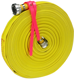
25mm Fire Hose