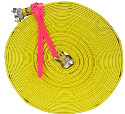
25mm Fire Hose