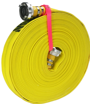
38mm Fire Hose