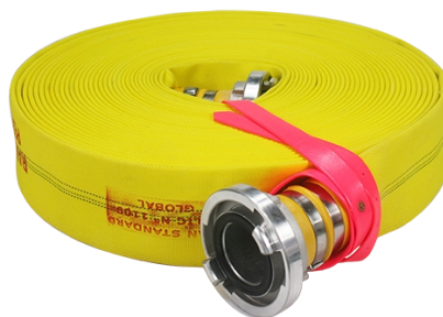
65mm Fire Hose