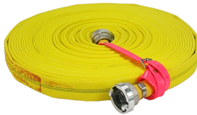
25mm Fire Hose