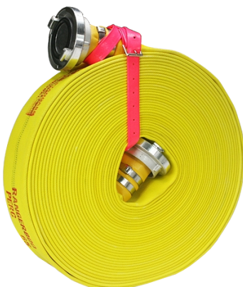
65mm Fire Hose