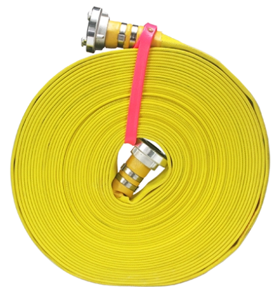
38mm Fire Hose