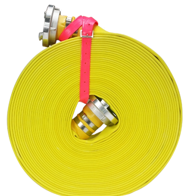
65mm Fire Hose