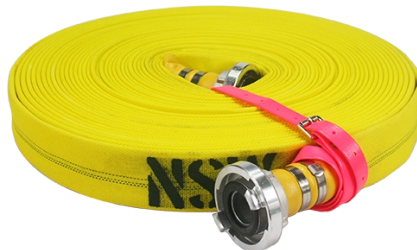
38mm Fire Hose